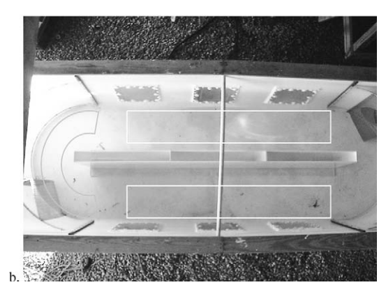
FIGURE 1.—Panel (a) shows a top view of the mesocosm in which the habitat preferences of robust redhorses were studied. The backwater environment, located in the upper right-hand corner behind the parabolic-shaped polyurethane divider, is outlined. Access to the backwater is via a window in upper right corner of the bend. Panel (b) shows a top view of the mesocosm with the main-channel environments and meander bend outlined (rectangles and semicircle, respective-ly).

least 4 years old are captured continuously in Clark Hill Lake, Georgia, downriver from the release sites (C. Jennings, unpublished data). The capture site on Clark Hill Lake is an average of 101 km downstream from all release sites of the hatchery-reared fish (Freeman et al. 2002). Why the fish were not collected for 4 years after their release is unknown and raises questions about (1) whether the sampling methods were capable of capturing robust redhorses of less than 385 mm TL, and (2) whether all environments were sampled sufficiently to detect juvenile robust redhorses.